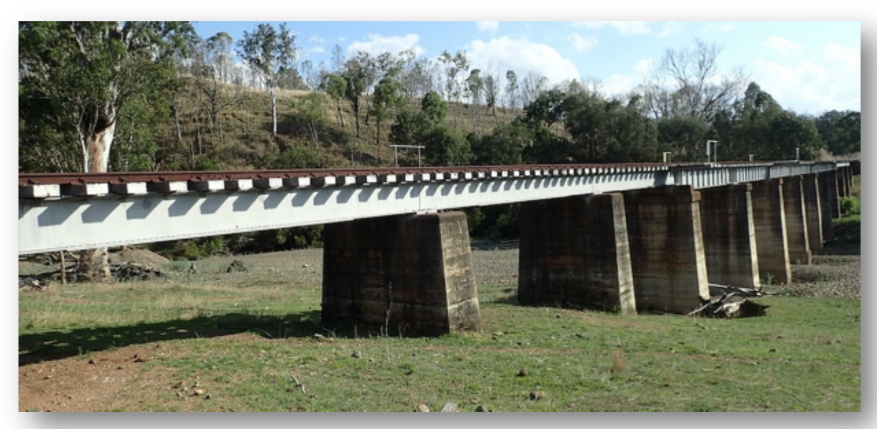
As well as being an attraction to rail trail users, the bridges along a disused railway corridor perform an important and necessary function: enabling users to cross rivers and creeks and other permanently wet areas.

Bridges are one of the most obvious reminders of the heritage value of disused railways, one of the most significant attractions of trails along disused railways and also one of the costliest items in the development of trails on former railways.