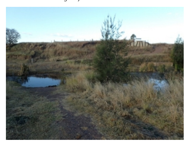
Above: A flooded waterway crossing on the Kingaroy Kilkivan Rail Trail.

Various options are available for waterway crossings, where the original bridge no longer exists. However, leaving a waterway crossing in a natural state (see photo at left) can lead to issues with trail usability.