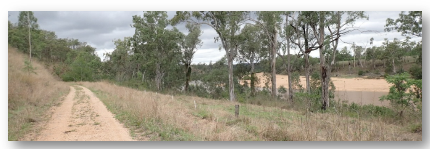
There are numerous locations where magnificent views of the surrounding landscape can be seen, including between Mundubbera and Gayndah where much of the corridor is alongside the Burnett River.