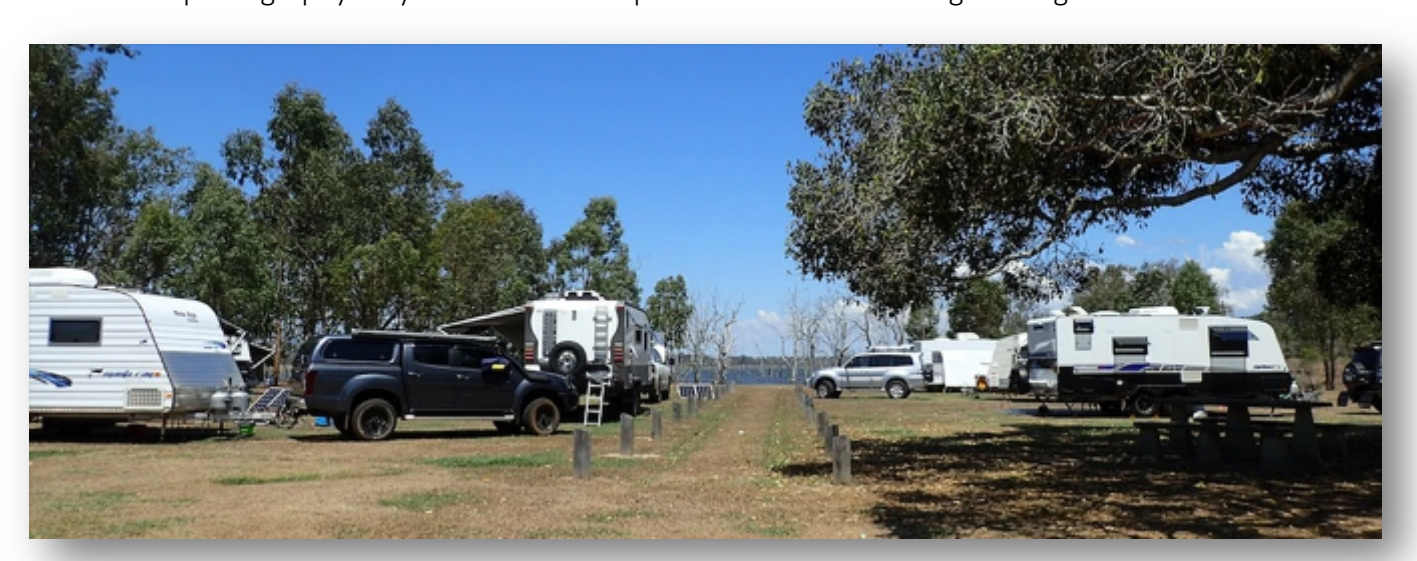
The Bush Camp at Boynedale, right alongside the disused railway corridor, is extremely popular. Development of a section of rail trail would enable visitors to cycle or walk to Ubobo and Nagoorin.

♣ Community support. While no formal consultation was carried out for this interim report, the consultants attended a meeting of the Boyne Burnett Inland Rail Trail Inc to meet key stakeholders. The number of people at the meeting (in the order of 50) was an impressive display of support for the project. There does appear to be a ground swell of support from groups and individuals within the surrounding communities. It is also evident that there are strong advocates within the communities who have expressed a desire to get more involved in ensuring the proposed rail trail gets developed. This was particularly demonstrated by another group who took the consultants to inspect the section of corridor between Mundubbera and Reids Creek. A committed community-based group is an important element in a rail trail's success. This commitment can be tapped into to ensure the rail trails succeeds should it proceed for ongoing maintenance and promotion. However, committed non-government groups should not be relied upon to take on the formal task of being the trail manager.