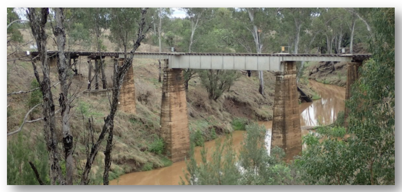
Many of the bridges traverse steep and deep creek valleys. Retention of the bridges is far preferable to construction of a lower level crossing.

Replacement and re-purposing costs are one of the considerations for rail trail bridges. Work on other timber rail trail bridges across Australia have returned costs of between $3,000 - $6,000/lineal metre up to $11,000/lineal metre.