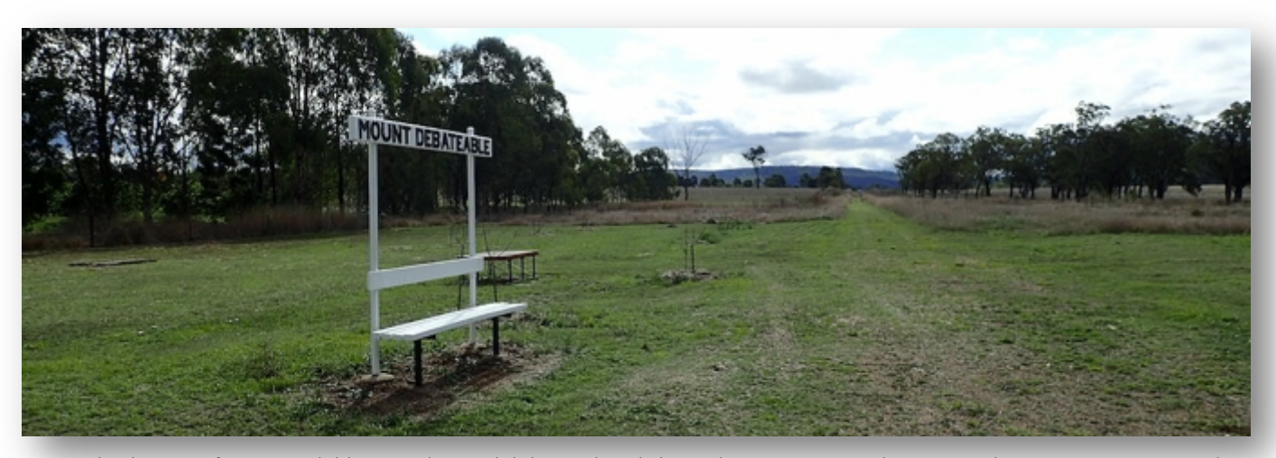
Local volunteers from Mundubbera and Gayndah have already been doing an outstanding service by renovating signs and keeping sidings well maintained. This volunteer effort – before a rail trail is already in place – augurs well for any future volunteer input that may be required should a trail be developed.

In Victoria, the Murrindindi Shire Council manages and maintains approximately 85% of the (134km) Great Victorian Rail Trail. It spends around $2,000/km on maintenance activities each year which the trail manager believes is insufficient. Anecdotal information indicates that initial construction issues necessitate an increased level of maintenance of the trail surface (and drainage through cuttings). A higher level of (initial) construction quality (i.e. better trail surfacing) would mean less ongoing maintenance.