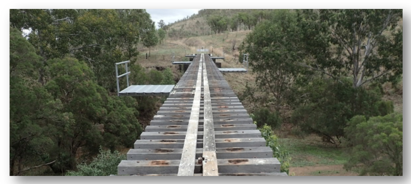
The Mundubbera to Mt Debateable section of the former railway corridor has the potential to become a well used rail trail and should be developed along with the other standalone trails mentioned throughout this report.