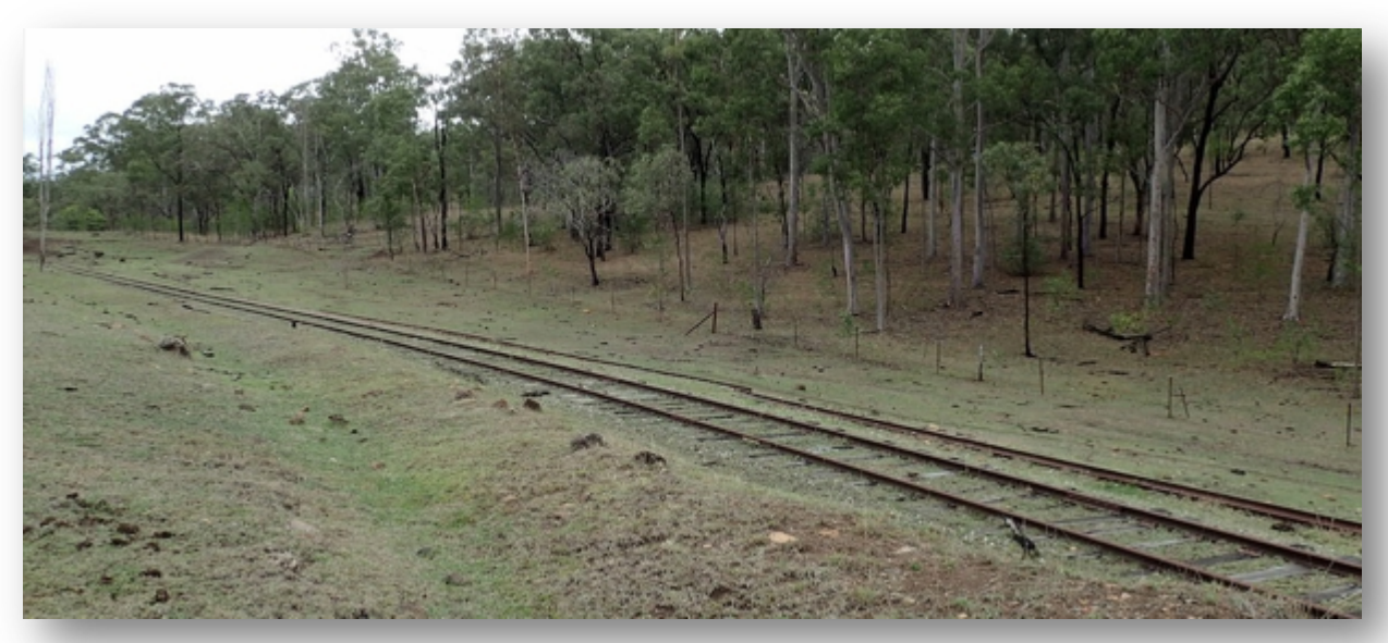
Appealing landscapes and scenery are certainly evident along sections of the former railway corridor.

The quality of intact railway heritage items varies along the corridor. Many bridges remain including significant and attractive bridges between Mundubbera and Reids Creek and at the northern end of the corridor in the vicinity of Lake Awoonga. Some of the railway stations remain and have been restored. The tunnels immediately north of Kalpowar provide an outstanding example of railway tunnels and the presence of 6 in a very short section is probably unmatched on an Australian rail trail. The hog's back sleepers, an unusual feature, add to the appeal of the tunnels. Much of the original railway signage has been removed, though it is being restored in the section between Mundubbera and Reids Creek.