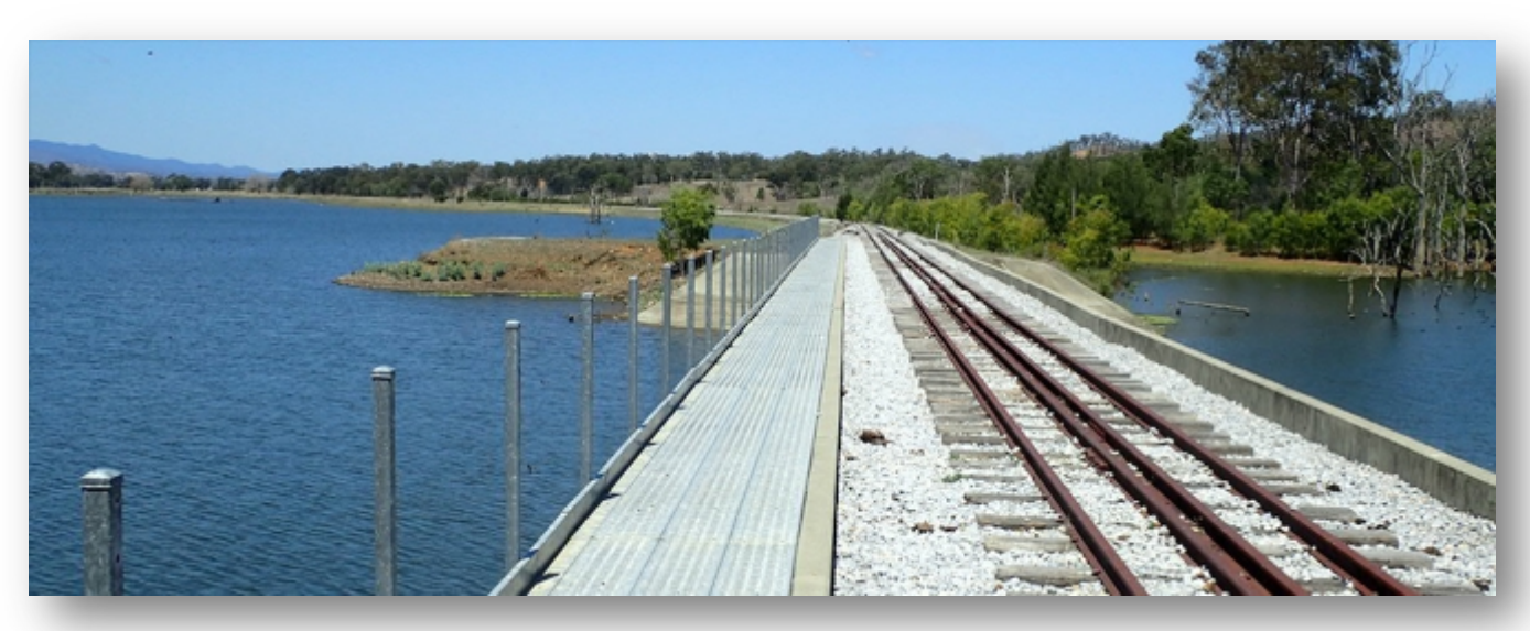
The disused railway runs alongside a substantial length of Lake Awoonga and provides outstanding views of the dam and surrounding landscape.

In total, these three trails would cover a distance of 94.48 kilometres. This would leave some 178 kilometres of the corridor not developed as a rail trail. Discussions on the retention or removal of any bridges within the proposed undeveloped sections will need to focus on issues other than their use in a rail trail (local heritage, advertising the region etc.). Removal of the bridges would make it harder if at any time in the future the remainder of the corridor could be repurposed for other reasons.