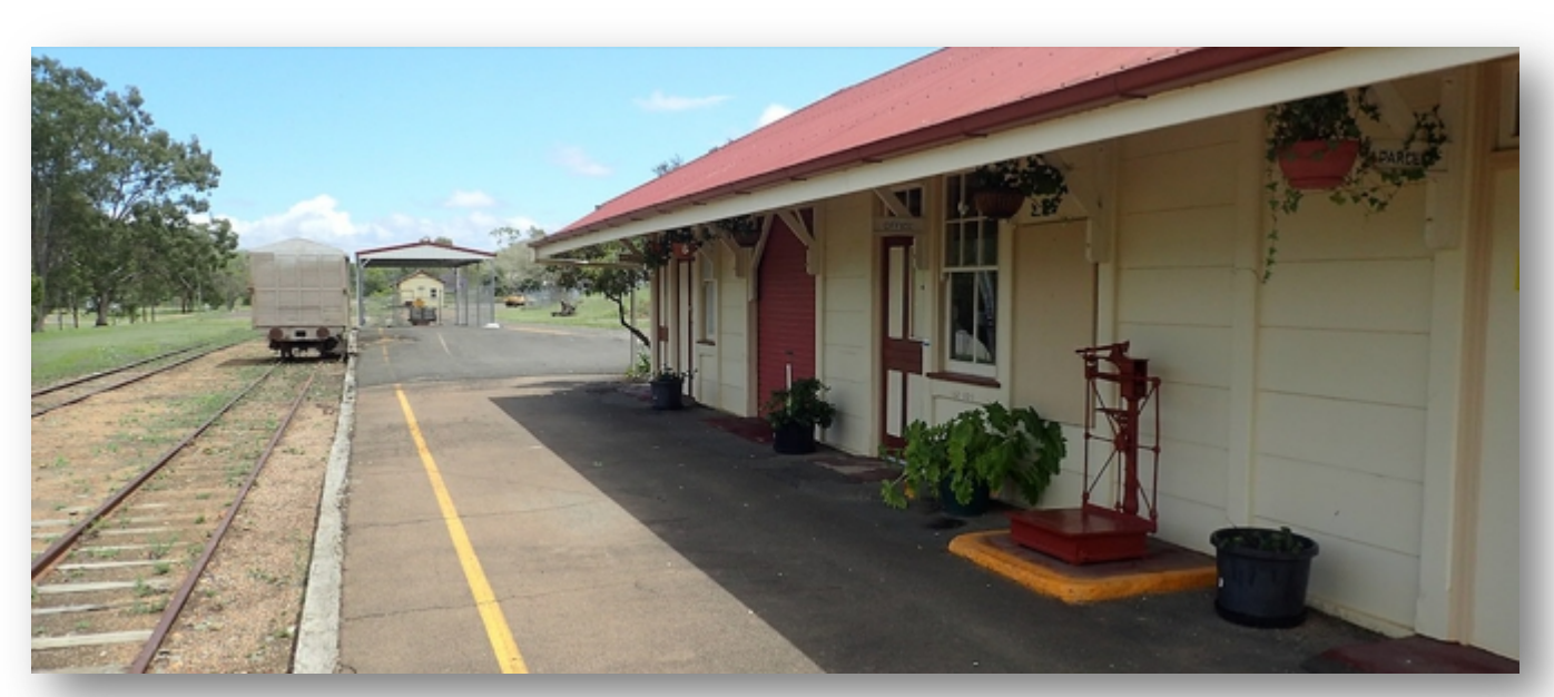
The old railway stations at Mundubbera (above) and at Gayndah have been preserved and restored, thanks to the hard work of local heritage groups.

This report is intended as an Interim Report within the Feasibility Study process to outline whether a rail trail is feasible between Taragoola and Reids Creek. This will then provide direction for the remainder of the investigation.