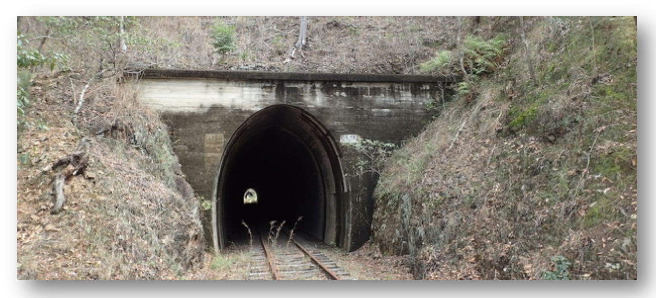
The six tunnels between Many Peaks and Kalpowar would be a unique feature of the proposed rail trail and a major attraction for potential visitors.

In early 2018, the Gladstone Regional Council and North Burnett Regional Council agreed to enter into a partnership to commission a feasibility study on the Reids Creek to Taragoola railway corridor.