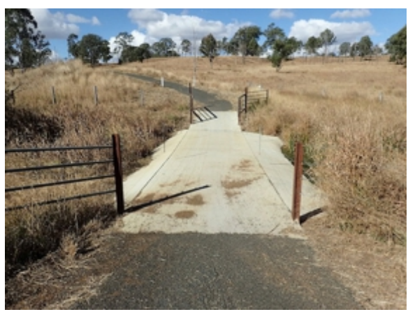
Above: A concrete floodway across a creek on the Kingaroy Kilkivan Rail Trail.