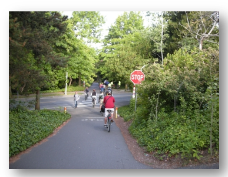
The Burke-Gilman Rail Trail in Seattle (Washington, USA) is one of that country's oldest and most popular rail trails. Studies along that trail corridor have demonstrated that property values have risen as a result of the development of the trail and are higher with close proximity to the trail.

"Rails-to-Trails" is what people called the phenomenon. The name was catchy and descriptive enough to give the concept a tiny niche in the fledgling environmental movement that was gathering momentum. However, it was destined to move into the mainstream of the conservation and environmental movements. After all, it had all the ingredients: recycling, land conservation, wildlife habitat preservation and nonautomobile transportation - not to mention historical preservation, physical fitness, recreation access for wheelchair users and numerous other benefits.