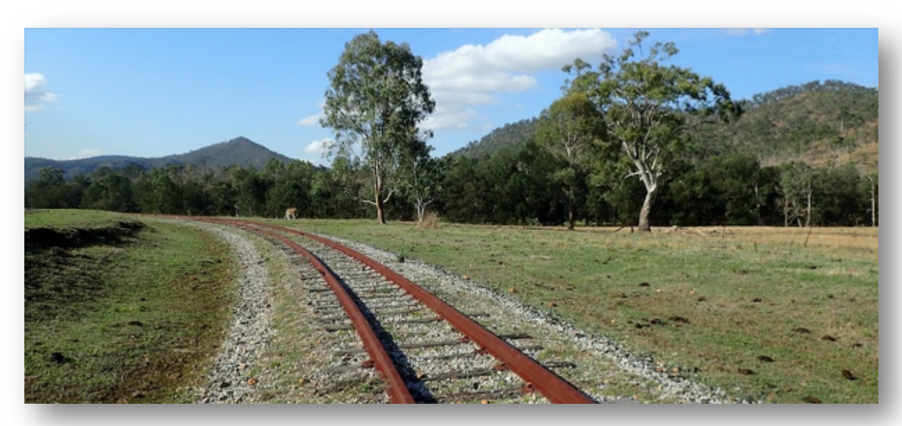
There is little doubt that some sections of the disused railway corridor are more outstanding in their beauty than others. The key to attracting visitors is to offer outstanding scenery, coupled with retention of relics and reminders of the former railway (bridges, tunnels, stations and sidings, embankments, cuttings and signage).

Williams Australian Bush Learning Centre. This trail could be used as it is now given it would be aimed at horse riders. Ideally the trail would end at the relocated Ceratodus Railway Station (in the roadside rest area); however, this would mean expending a large amount of money to repurpose the bridge over the Burnett River for a relatively low number of users. It has been indicated that the bridge would be retained due to its heritage value and riders could ride out to it and then ride back to Eidsvold (a return ride of just over 20 kilometres). This is provided for consideration and is not included as a specific recommendation.