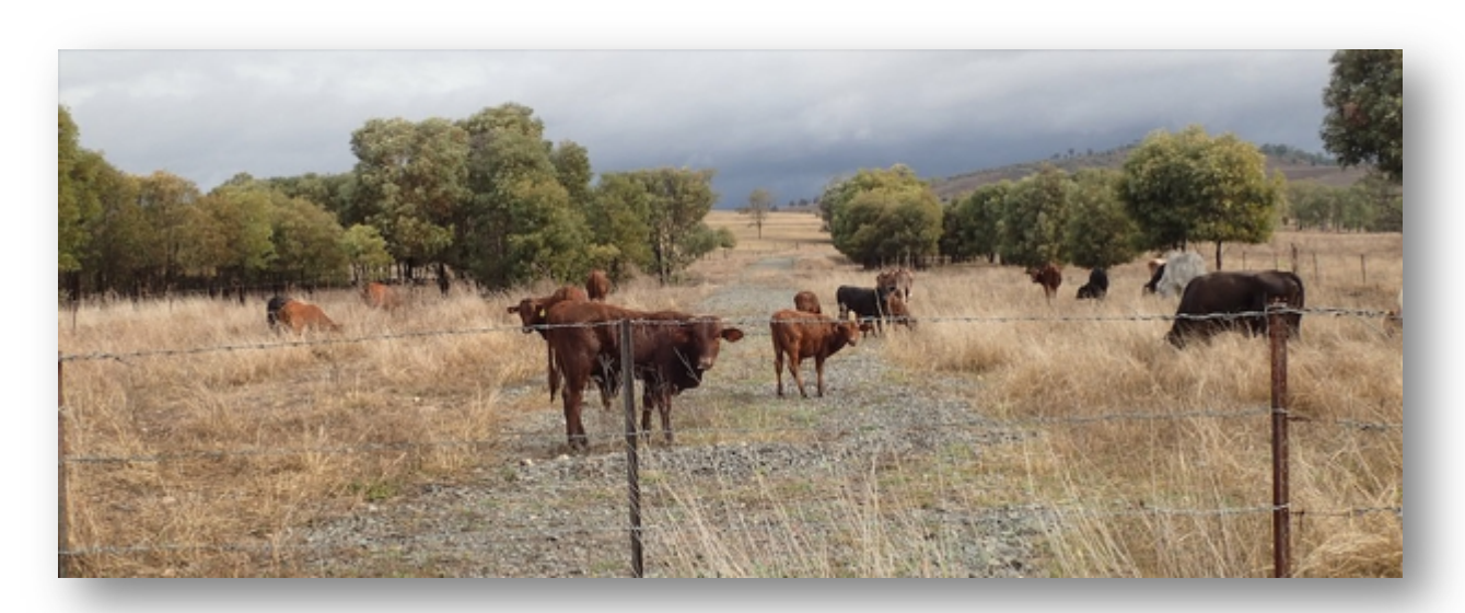
While the disused railway corridor provides spectacular vistas in numerous locations, several lengthy sections bisect farming areas and development of a trail will mean special measures will need to be put in place to allow farming to continue.

A long trail versus a series of shorter rail trails. If fully developed along its entire length, the proposed Boyne Burnett Inland Rail Trail would be a rail trail of 270.75 kilometres — the longest rail trail in Australia. Whilst this has some appeal (simply being the longest may attract some particular usage), the case can be made that developing a series of shorter trails provides a better experience for a wider range of users (and provides for a cheaper project to both build and maintain). Long rail trails are relatively rare in Australia and New Zealand (the Brisbane Valley Rail Trail is the longest in Australia at 161 kms). Despite the recent growing popularity of the long walk trails, available research indicates short trails are still the most popular form of trail. The low number of long rail trails in Australia may suggest that demand for such a product is relatively low, though it is hard to make a decisive comment as demand data does not exist.