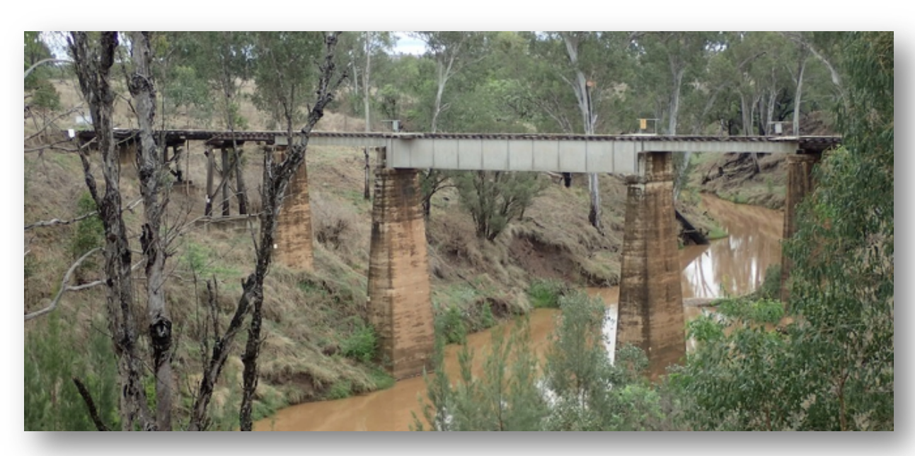
The heritage listed railway bridges between Mundubbera and Gayndah are being retained.

Some important reminders of the former railway remain along the corridors of both lines. Many of the railway stations along the entire section of the corridor remain and have been repurposed (Mundubbera and Monto are two good examples) or re-located close by (at Ceratodus). Gayndah Station (though outside the study area) has also been restored. Cuttings and embankments are a feature along the corridor. Many bridges remain in some sections and the six tunnels between Kalpowar and Many Peaks are reminders of railway history. These tunnels are locally heritage listed. An active community group has restored much of the signage (siding and railside signs) between Reids Creek and Mundubbera.