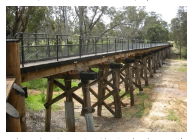
Above: The Sidings Rail Trail (WA) makes the most of existing historic rail infrastructure. This trail has two elements — as well as being a rail trail in itself, it is part of the Munda Biddi Trail — the long distance mountain bike trail between Perth and Albany.