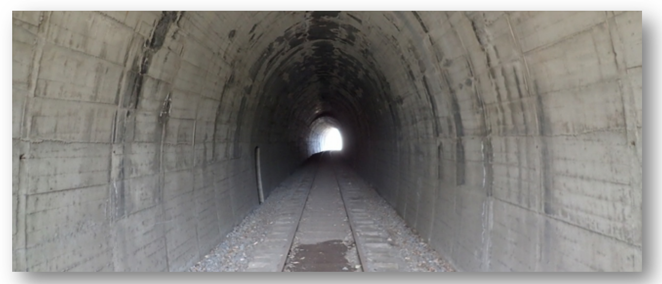
The walls of the 6 tunnels between Many Peaks and Kalpowar appear solid and safe. However, a detailed inspection will provide further information on their integrity.

If it is assumed that half of the trail can be constructed at the lower cost (an average of $130,000/km) and half can be constructed at the higher cost (allow $200,000/km), building a long trail on the entire distance of the corridor would cost in the order of $45 million.