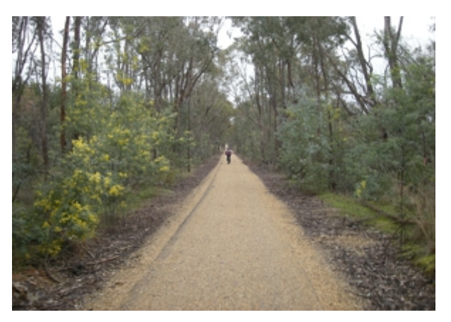
Above: The Murray to the Mountains Rail Trail is one of Australia's highest profile rail trails; users are spending around $250/day while using the trail.