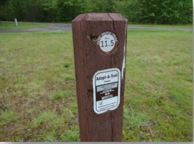
Trail managers and "Friends of ..." groups often arrange 'Adopt-a-Trail' programs to ensure the rail trail is well maintained – by volunteers. The majority of some trails, such as the Bibbulmun Track, is maintained by volunteers.

Evidence of actual trail maintenance costs for individual items along a rail trail, or any trail for that matter, are scarce. The Rail to Trails Conservancy in the USA ( Rail-Trail Maintenance and Operation – Ensuring the Future of Your Trails – A Survey of 100 Rail-Trails, July 2005 ) provides two general answers for why it is difficult to estimate maintenance costs. First, the trail may be part of a larger budget for a single park or even an entire parks and recreation department. Specific costs for the trail aren't separated out. Second, small trail groups, though run by competent and extremely dedicated volunteers, tend to be 'seat-of-the-pants' operations. Maintenance is done "as needed," funds are raised "as needed," and the people are volunteering because they love the trail, not because they love doing administrative tasks like budgeting.