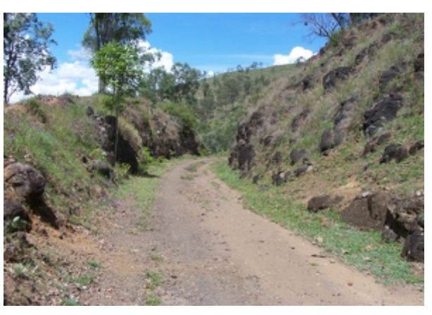
Above: The Brisbane Valley Rail Trail (Qld) is Australia's longest rail trail, attracting users from South East Qld, one of Australia's fastest growing regions.