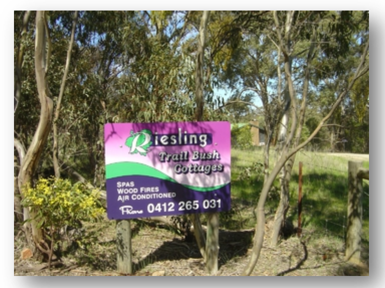
Several accommodation establishments are clearly benefiting for locating close to the Riesling Trail, resulting in economic benefits to the businesses and a bigger range of accommodation options cyclists and walkers using the trail.

Comments on the length of the trail above apply.