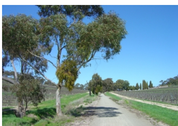
Above: The Riesling Trail is South Australia's premier rail trail, travelling through the very attractive winegrowing country of the Clare Valley.