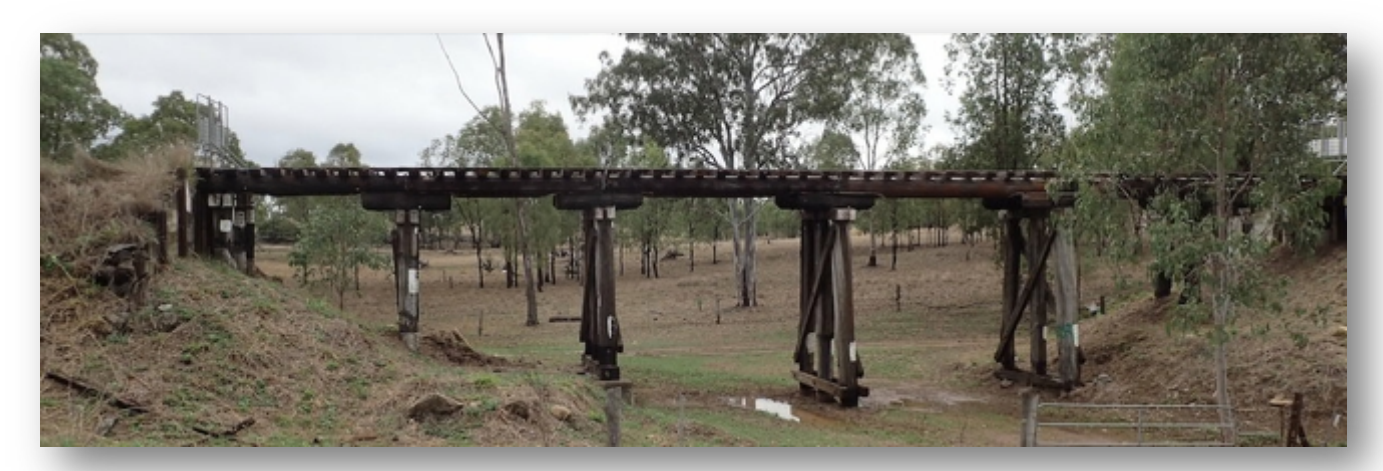
Development of a series of rail trails, including installation of decking and handrails on bridges, will enable easy walking and cycling between towns.

Connecting the towns and villages via a trail will also provide an opportunity for local residents to choose a non-motorised connection for visiting friends or undertaking some exercise. A non-motorised trail provides another psychological link between the towns on the route.