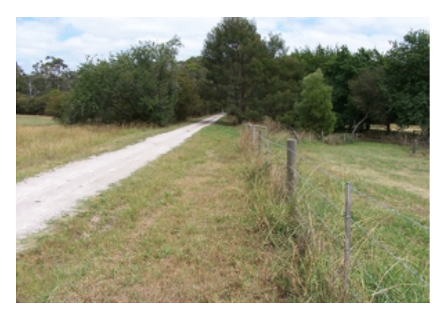
Above: The Lilydale Warburton Rail Trail (Victoria) is about an hour from the Melbourne CBD. This proximity helps attract over 100,000 users per year.