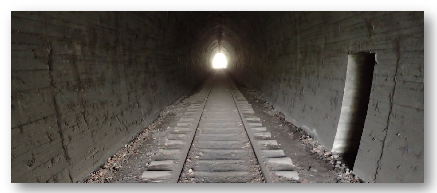
Retention of the unique hog's back timber railway sleepers within the tunnels is one of the key factors to be considered when developing the rail trail.

The boundary between the two Local Governments lies between Kalpowar and the southernmost tunnel.