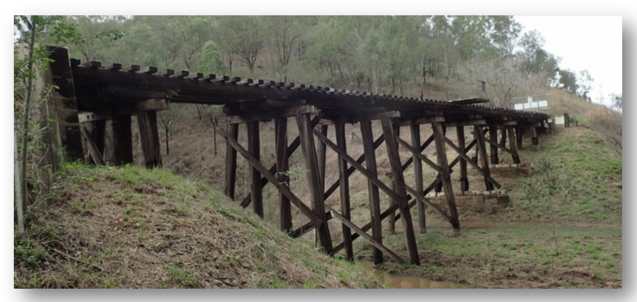
Many of the timber bridges have been removed from the corridor: however, some of the most strategically positioned bridges have been retained for future rail trail use.

The Boyne Valley west of Gladstone was predominantly a dairying region and a railway had little justification. However, a branch was justified in 1906 on the basis of large traffic in timber, fuel, limestone and flexing ores. Progressively opened between 1910 and 1931, the line branched from the North Coast line at Byellee a short distance west of Gladstone and struck a south-westerly route via Many Peaks and Mungungo to Monto. The initial construction was from Byellee to Many Peaks. The line was built to transport low grade ore from Many Peaks to Mount Morgan for processing. A train of copper flexing ore ran to Mount Morgan daily and a mixed train to Gladstone and return ran four days a week. Cream and agricultural goods provided the major source of revenue when the Many Peaks mine closed in 1918. The next stage (Many Peaks to Barimoon), though short, took a long time to construct due to the steep terrain through which it passed. A ten-kilometre section beyond Golembil required the construction of six tunnels totalling 730 metres to negotiate a 239-metre climb of the Dawes Range. In 1930, the railway was extended to Mungungo and in July 1931 finally reached Monto thus completing a semi-circular inland link between Maryborough and Gladstone via the already completed line running north west from Mungar Junction through Gayndah, Mundubbera and Eidsvold.