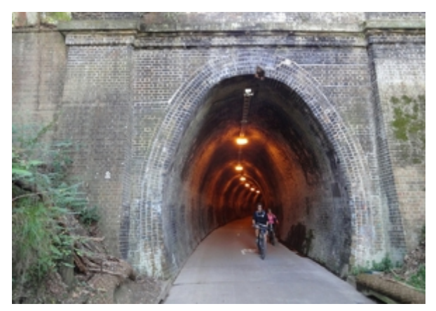
Above: The Fernleigh Track in Newcastle is exceedingly popular with a range of users. One of its key attractions is the Fernleigh Tunnel.