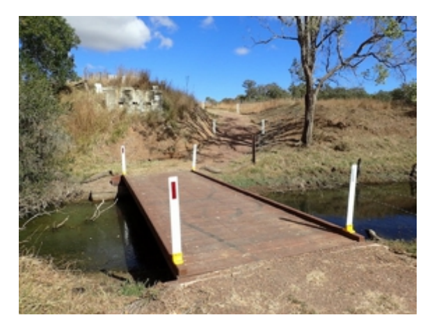
Above: A low level timber bridge across a creek on the Kingaroy Kilkivan Rail Trail.

position is to retain all the timber bridges that are needed for the rail trails (i.e. those along the three identified short trails). However, it may be that this is not achievable (though the identification of three short trails does take some of the remaining bridges off the "needed for a rail trail" list). Those bridges identified as not being required as there are alternative crossing options can be removed and alternatives put in place (noting that this is not a no-cost or the preferred option). Bridges identified as required as either definitely or probably the only logical crossing to retain connectivity for a potential rail trail should be retained. This is particularly the case for any bridges on the corridor between Nagoorin and Futters Creek on the eastern side of the Gladstone Monto Road. The topography in this location ensures there will be major water flows from time to time from the road towards the dam – bridges represent the best way of ensuring safe crossings even in high flows.