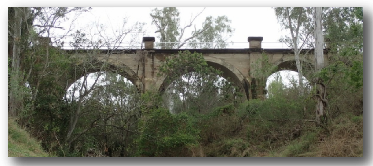
The historic and heritage listed bridges between Mundubbera and Gayndah are a major factor influencing the attractiveness of this section of disused railway corridor for development of a standalone rail trail.

More recently, representatives from Gladstone Regional Council and North Burnett Regional Council (the two councils through which the corridors pass) have been working with the Boyne Burnett Inland Rail Trail Inc, established by the community to champion the development of the rail corridor and represent the expectations of the community.