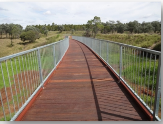
Repair work on the bridge over Jimmy's Gully (on left) on the Brisbane Valley Rail Trail was complex and cost $11,000/lineal metre. The Tingoora bridge on the Kingaroy Kilkivan Rail Trail (on right) was around $1,700 lineal metre for re-purposing.

experience and often come with significant maintenance issues. Not using the bridges means the loss of an essential part of the rail trail experience. If the trail proceeds, there is a strong case for retention of bridges for their heritage and convenience/utility value. Riding down a steep path to cross a creek then up an equally steep climb on the other side presents at least some trail users with daunting technical and physical challenges and necessitates careful design, construction and maintenance of gully/watercourse approaches to provide for safety and prevent erosion (use of at-grade culverts can address this issue). Retention of the bridges also retains the positive experience of riding along the top of old bridges with panoramic views of the surrounding landscape. The rail bridges were originally built in their locations primarily because railways need very gentle grades or slopes and the same principle applies to re-use of railways as recreation trails. Bridges also provide a safe crossing when water is flowing in gullies, creeks and rivers. Indicative costs for other options are presented below in Table 2: