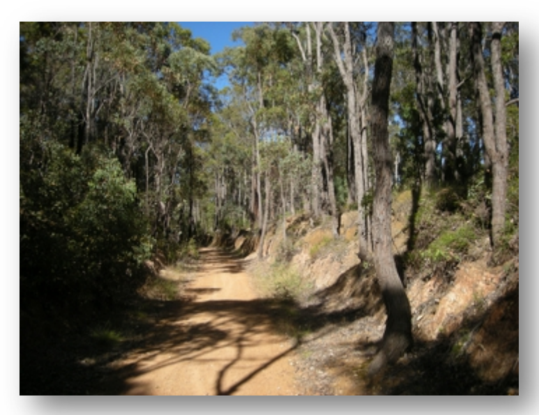
Aware of the tremendous economic and recreational benefits of the Railway Reserves Heritage Trail, the Shire of Mundaring continues to expend funds on improving the trail.

In Queensland, former rail corridors are designated as 'non-motorised transport corridors'. As a relatively new entity, management arrangements are still being settled. The Department of Transport and